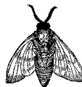
Figure 2: A sample black and white graphic that has been resized with the includegraphics command.

the input file; again, it is instructive to compare the placement of the table here with the table in the printed output of this document.