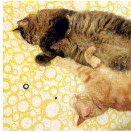
Figure 2: MFM images of the bi-component Py/Co dots for different values of the applied magnetic field which are indicated by greek letters along both the major and minor hysteresis loop.

To directly visualize the evolution of the magnetization in the Py and Co subunits of our bi-component dots during the reversal process, we performed a field-dependent MFM analysis whose main results are reported in Fig. 2. At large positive field ( H = +800 Oe, not shown here) and at remanence ( \alpha point of the hysteresis loop of Fig. 1), the structures are characterized by a strong dipolar contrast due to the stray fields emanated from both the Py and Co dots.