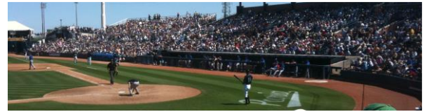
Figure 1: MOKE hysteresis loop for the bi-component Py/Co dots array measured along the dots long axis.

In the last decade, there has been an intense research activity in studying the spectrum of magnetic eigenmodes both in single and multi-layered confined magnetic elements with different shape and lateral dimensions [1–3]. This interest has been further renewed by the emergence of the spin-transfer torque effect, where a spin-polarized current can drive microwave frequency dynamics of such magnetic elements into steady-state precessional oscillations. Moreover, the knowledge of the magnetic eigenmodes is very important also from a fundamental point of view for probing the intrinsic dynamic properties of the nanoparticles. Besides, dense arrays of magnetic elements have been extensively studied in the field of Magnonic Crystals (MCs), that is magnetic media with periodic modulation of the magnetic parameters, for their capability to support the propagation of collective spin waves [4,5]. It has been demonstrated that in MCs the spin wave dispersion is characterized by magnonic band gaps, i.e. a similar feature was already found in simple two-dimensional lattices with equal elements like.