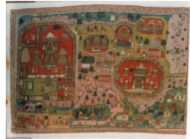
Figure 6: Calculated frequency evolution of modes detected in the BLS spectra.

In Fig. 6 the calculated frequencies of the most representative eigenmodes at +500 Oe (FM state) and -500 Oe (AP state) are plotted as a function of the gap size d between the Py and Co sub units (please remind that in the real sample studied here, d = 35 nm). As a general comment, it can be seen that the frequencies for the system in the AP state are more sensitive to d than those of the P state. In particular, the lowest three frequency modes of the AP state (EM(Co), EM(Py) and F(Py)) are downshifted with