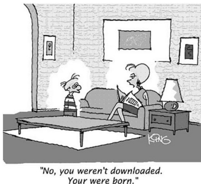
Figure 10.1. A typical figure

Figures and tables captions should be centered if less than one line (Figure 10.1), otherwise justified and indented by 0.8cm on both margins, as shown in Figure 10.2. The font must be Helvetica, 10 point, boldface, with 6 points of space before and after each caption.